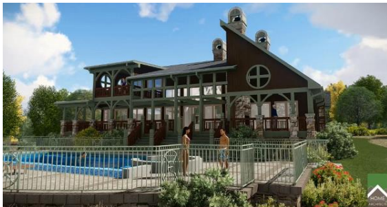
A HOME ARCHITECTS® lake side project 3D video imagery

BOTTOM LINE: Not all firms have this capability. This firm does.